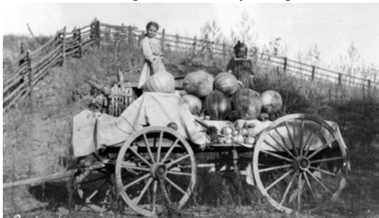
Photographer L. A. Huffman's Dry Landers on Little Pumpkin, no date, is one of the many photographs that will be featured in Montana by Food.